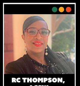
ACSW Mental Health Provider Executive Director of The People's Empowerment Center